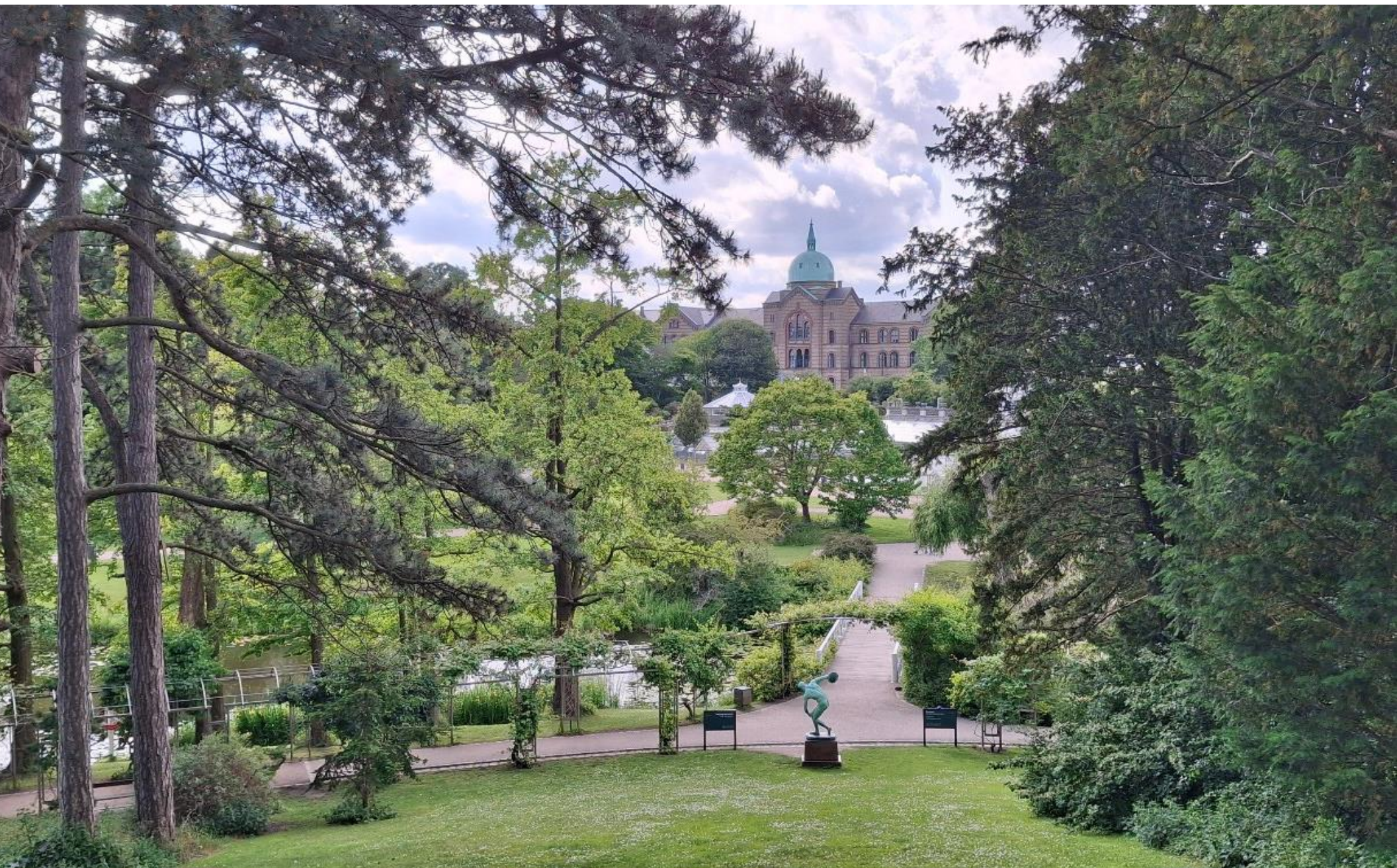
Huge parks connect different parts of town