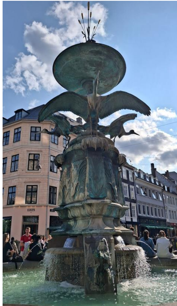
"STORKS" EDVARD PETERSEN VILHELM BISSEN 1894