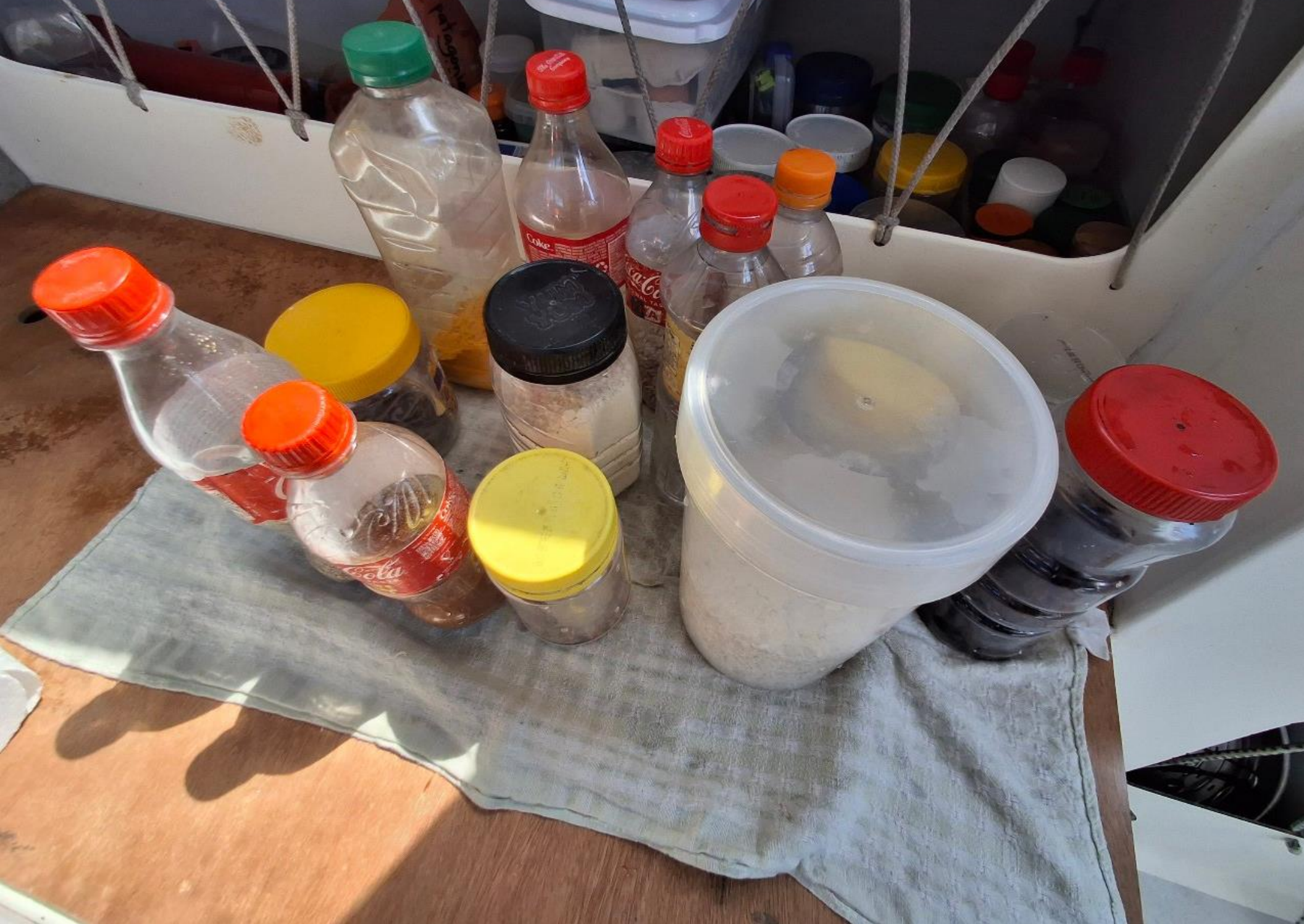
The spices and other food, after floating in seawater, are safe from damage, so is the computer and, except for one radio, all electronics