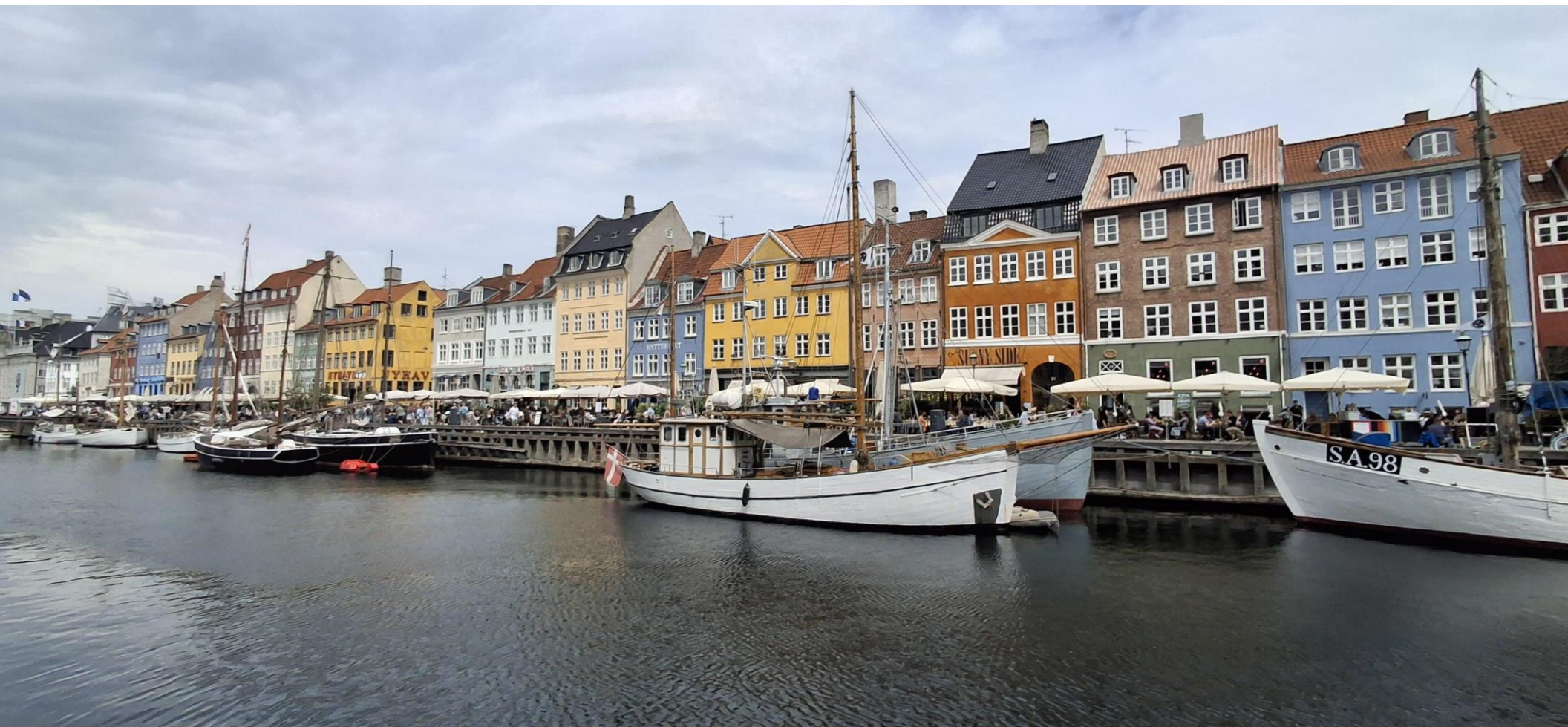
Colourful houses line the canals