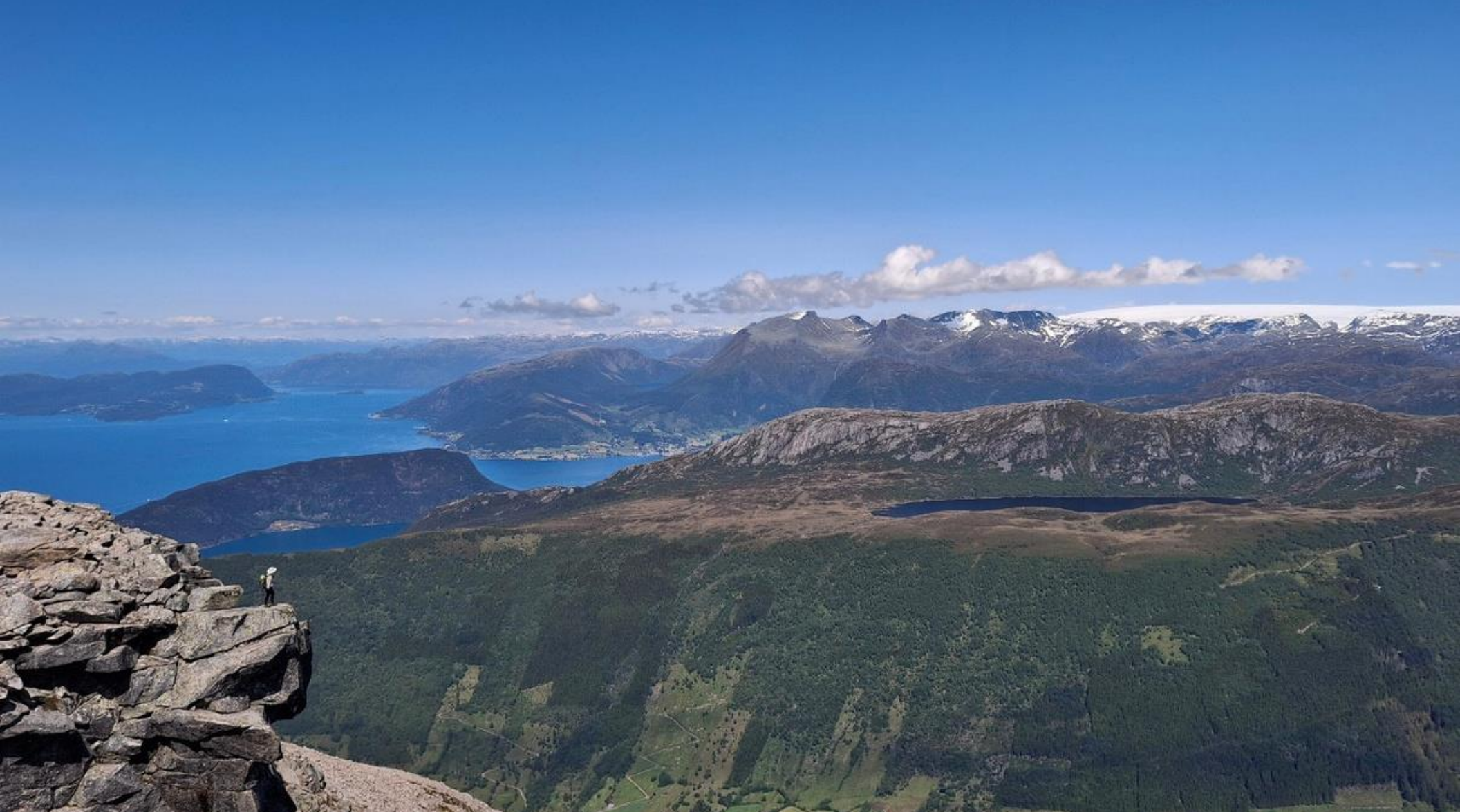
View from Mt Englafjell, 1200m, of the Folgefonna Glacier, 1660m