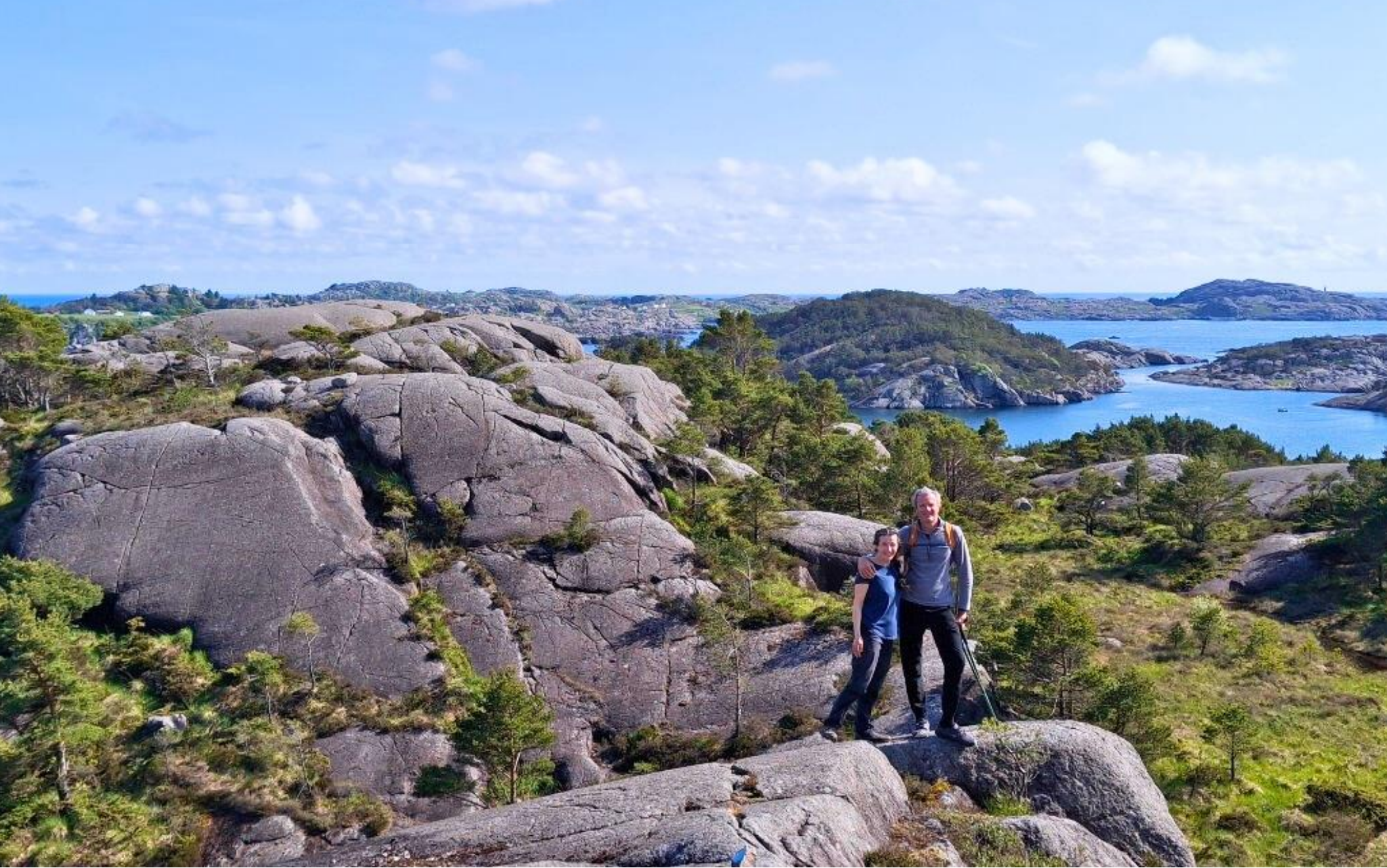
Rocky shores of southern Norway