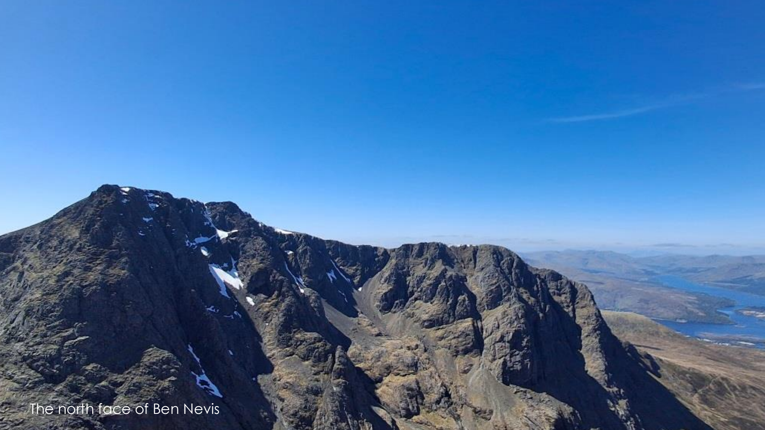
The north face of Ben Nevis